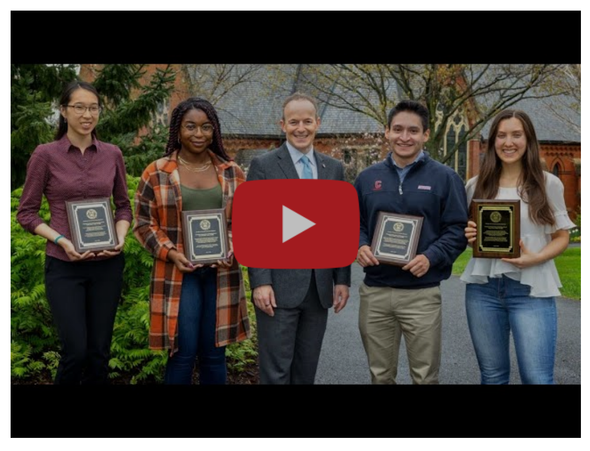
Cornell Campus-Community Leadership Award Webinar 5-5-22